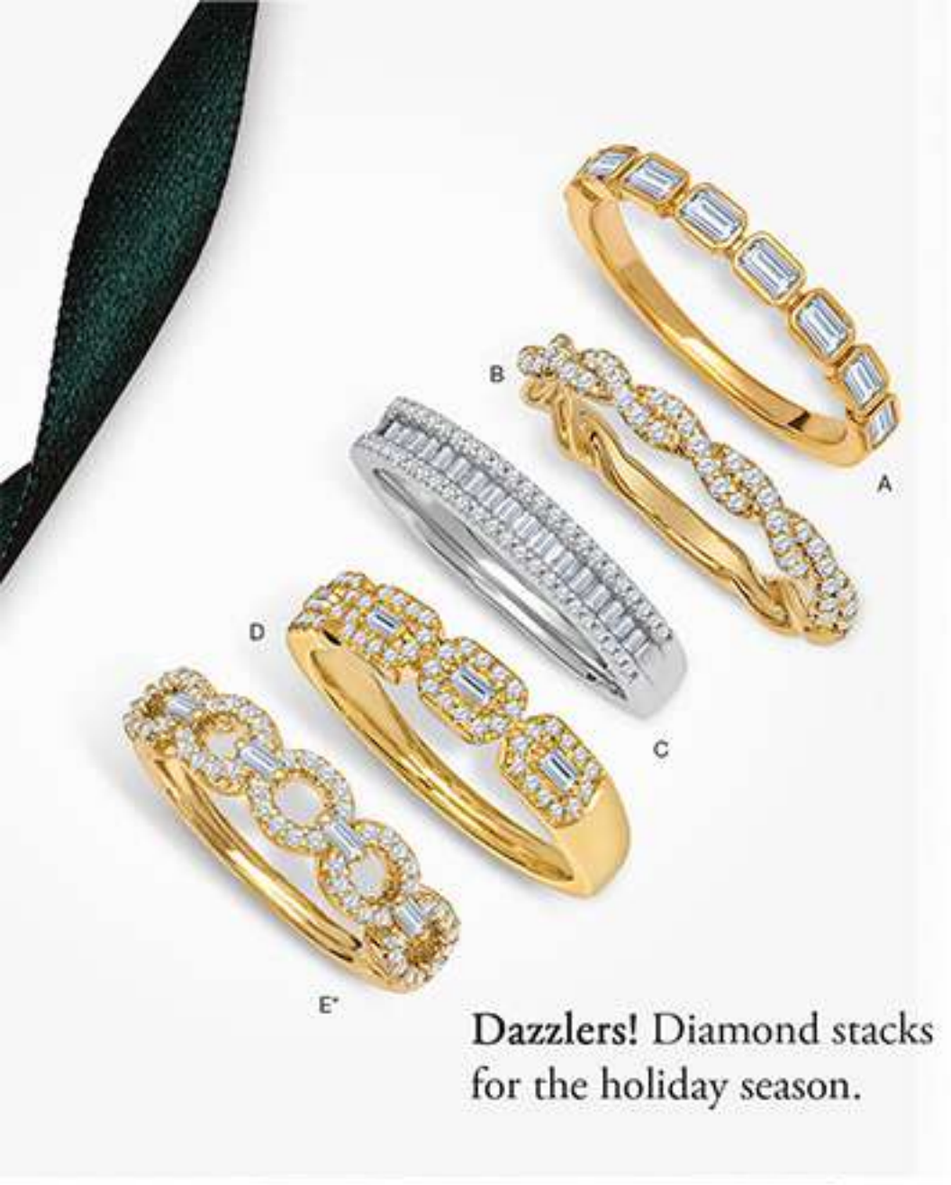
Dazzlers! Diamond stacks for the holiday season.