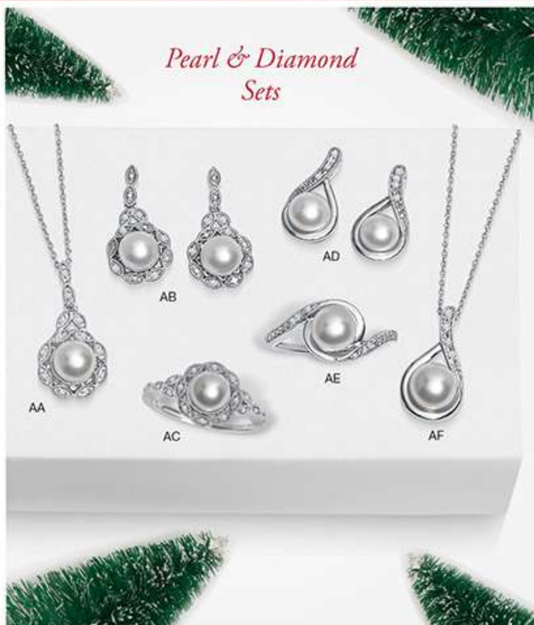
Pearl & Diamond Sets

A. Diamond rectangular medallion pendant B. Diamond cross pendant C. Diamond infinity cross pendant D. Diamond snowflake pendant E. Diamond twin heart pendant F. Diamond round medallion pendant G. Diamond heart arrow pendant H. Diamond min heart pendant J. Diamond infinity heart pendant K. Diamond angel wing pendant L. Diamond crosslariat bracelet M. Diamond bar lariat bracelet N. Diamond infinity lariat bracelet P. Diamond angel wing earrings Q. Amethyst and diamond pendant R. Amethyst and diamond ring S. Amethyst and diamond earrings T. Blue topaz and diamond pendant U. Blue topaz and diamond earrings V. Amethyst and diamond ring W. Amethyst and diamond pendant X. Blue topaz and diamond bracelet Y. Amethyst and diamond bracelet Z. Blue topaz and diamond bracelet AA. Pearl and diamond pendant AB. Pearl and diamond earrings AC. Pearl and diamond ring AD. Pearl and diamond earrings AE. Pearl and diamond ring AF. Pearl and diamond pendant