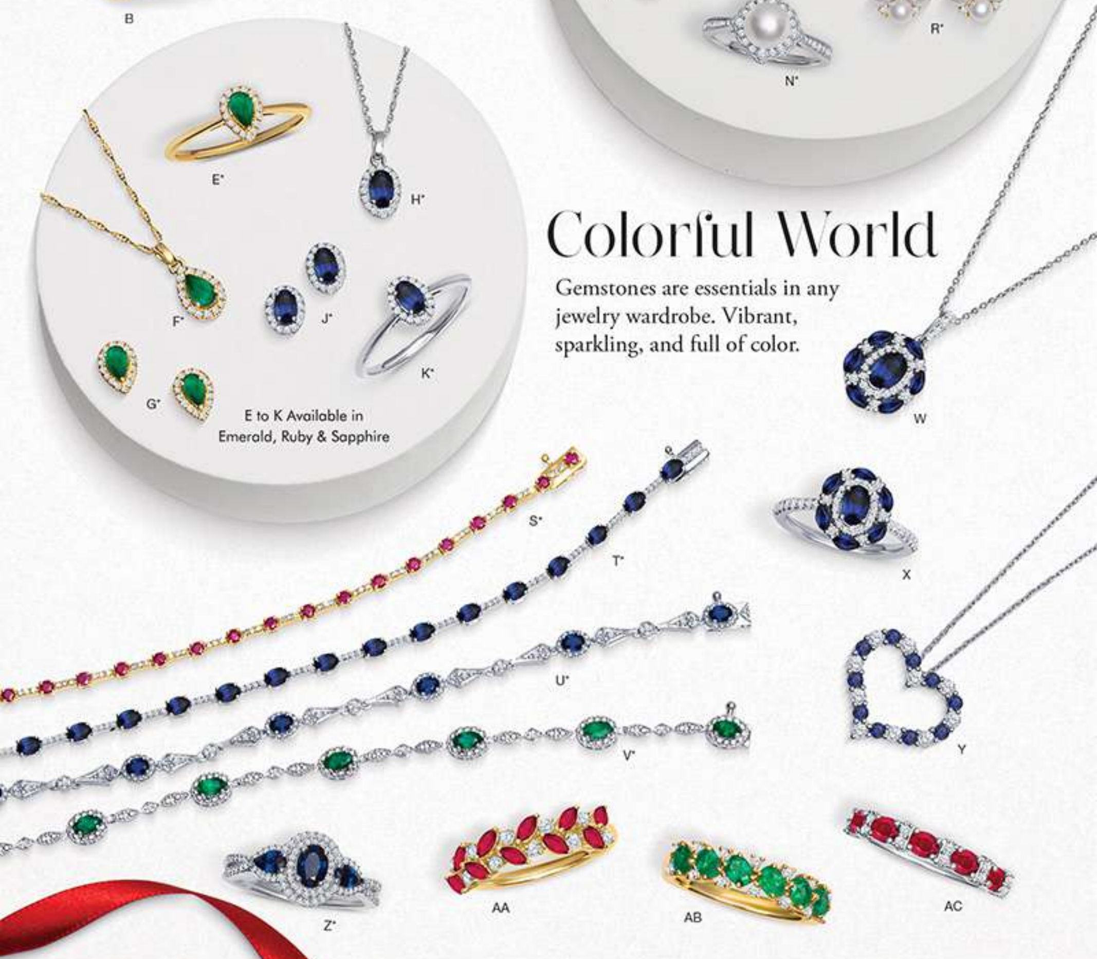
A. Ruby and diamond pendant B. Ruby and diamond ring C. Sapphire and diamond pendant D. Sapphire and diamond ring E. Emerald and diamond ring F. Emerald and diamond pendant G. Emerald and diamond earrings H. Sapphire and diamond pendant J. Sapphire and diamond earrings K. Sapphire and diamond ring L. Pearl and diamond pendant M. Pearl and diamond halo pendant N. Pearl and diamond halo ring P. Pearl and diamond pendant Q. Pearl and diamond ring R. Pearl and diamond earrings S. Ruby and diamond bracelet T. Sapphire and diamond bracelet U. Sapphire and diamond bracelet V. Emerald and diamond bracelet W. Sapphire and diamond pendant X. Sapphire and diamond ring Y. Sapphire and diamond heart pendant 1/8 carat tw, 1/4 carat tw, 1/2 carat tw Z. Sapphire and diamond ring AA. Ruby and diamond band AB. Emerald and diamond band AC. Ruby and diamond band

Gemstones are essentials in any jewelry wardrobe. Vibrant, sparkling, and full of color.