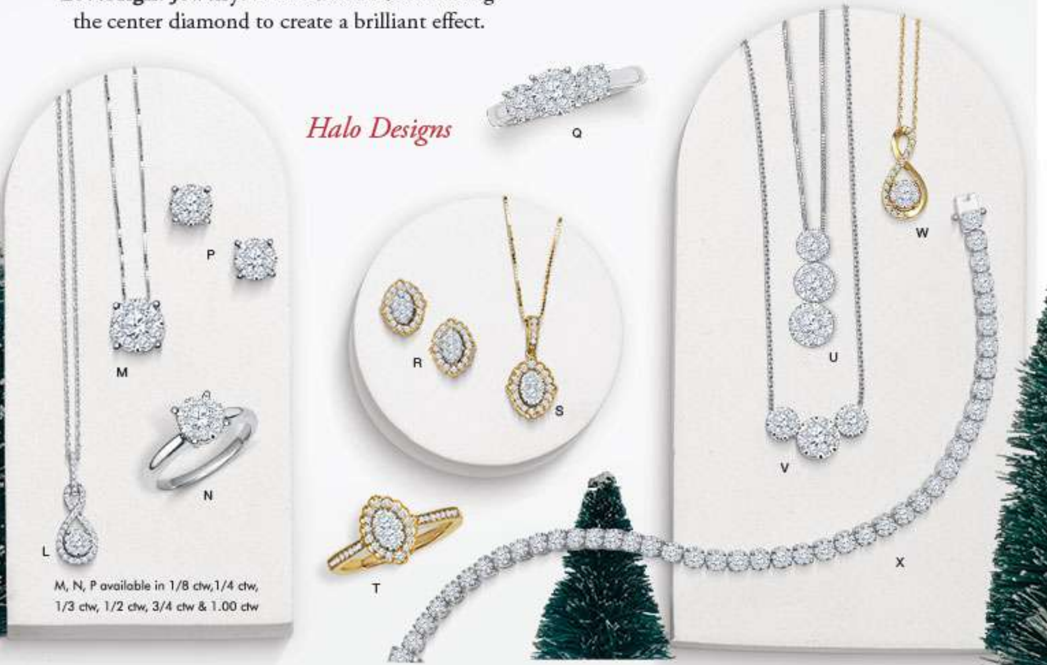
A. 1/2 carat tw scatter necklace B. 1/5 carat tw scatter necklace C. 1/4 carat tw scatter earrings D. 1 carat tw mixed shape diamond pendant E. 1/2 carat tw scatter necklace F. 1/5 carat tw scatter ring G. 1/6 carat tw curb link ring H. 1/3 carat tw curb link hoop earrings J. 1/3 carat tw curb link pendant K. 1 carat tw curb link bracelet L. 1/4 carat tw pendant M. Halo pendant 1/4 carat tw, 1/2 carat tw, 3/4 carat tw, 1 carat tw N. Halo ring 1/4 carat tw, 1/2 carat tw, 3/4 carat tw, 1 carat tw P. Halo earrings 1/4 carat tw, 1/2 carat tw, 3/4 carat tw, 1 carat tw Q. 3 stone ring 1/3 carat tw, 1/2 carat tw, 1 carat tw R. 1/4 carat tw oval earrings S. 1/4 carat tw oval pendant T. 1/3 carat tw oval ring U. 3 stone pendant 1/4 carat tw, 1/2 carat tw, 3/4 carat tw, 1 carat tw V. 3 stone pendant 1/3 carat tw, 1/2 carat tw, 3/4 carat tw, 1 carat tw W. 1/5 carat tw pendant X. Halo bracelet 3 carat tw 5 carat tw