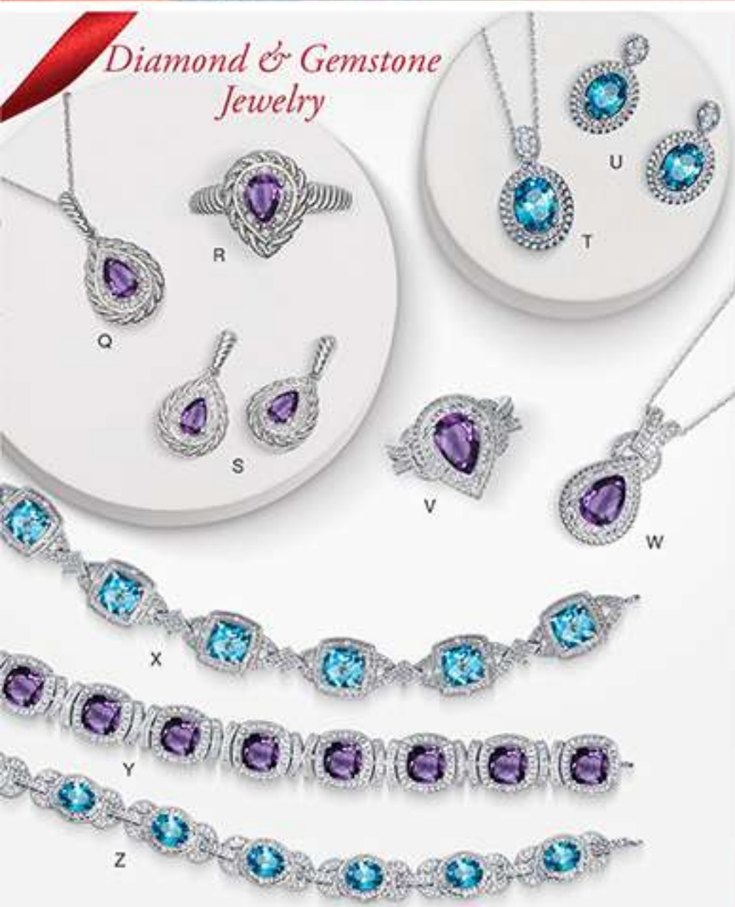
Diamond & Gemstone Jewelry

Whether you're looking to surprise a loved one or treat yourself, the versatility and beauty of silver jewelry make it a perfect choice.