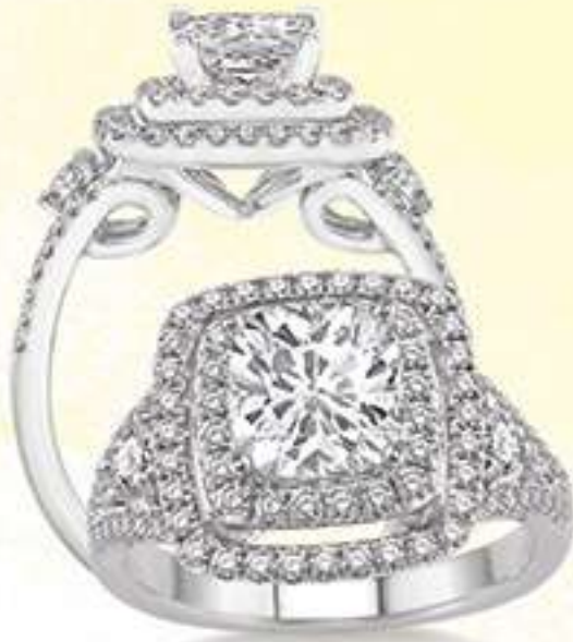
20D 22182SM .90 DM 14K Center stone size - 7/8 to 1 1/4 ct. $4,795