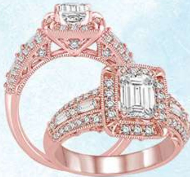
11C 230A2SM .75 DM 14K Center stone size - 7/8 to 1 1/4 ct. $3,950