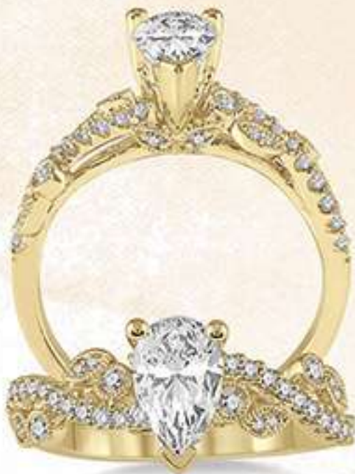
14D 256E5SM .30 DM 14K Center stone size - 5/8 to 7/8 ct. $1,750