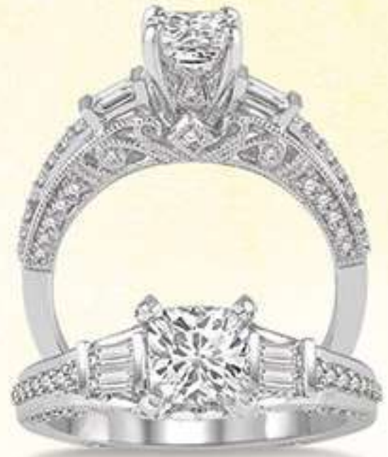
22B 245B4SM .40 DM 14K Center stone size - 3/8 to 5/8 ct. $2,650