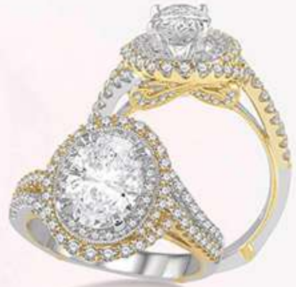
3B 220G2SM .90 DM 14K Center stone size - 1 to 1 1/4 ct. $4,095