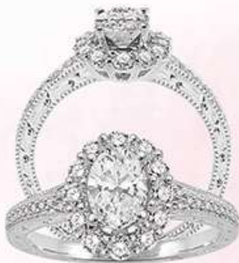
2D 249C3SM .55 DM 14K Center stone size - 1/2 to 3/4 ct. $2,595