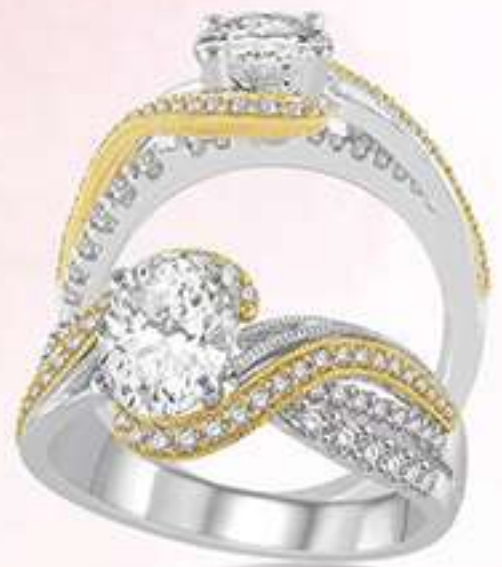
6E 268A3SM-OV .45 DM 14K Center stone size - 7/8 to 1 1/4 ct. $2,795

Center stone sold separately Matching band available