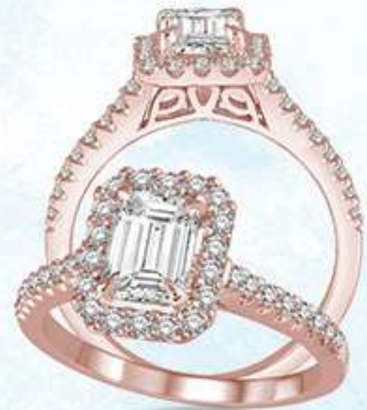
8E 215D4SM .40 DM 14K Center stone size - 7/8 to 1 1/4 ct. $1,795

Center stone sold separately Matching band available