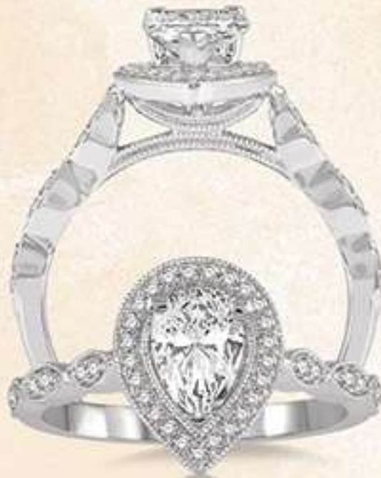
14C 210H8SM .15 DM 14K Center stone size - 1/2 to 3/4 ct. $1,595