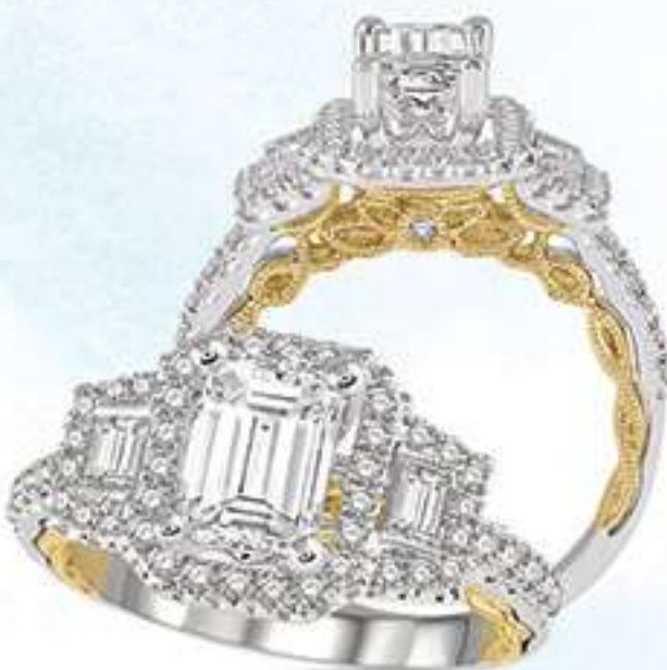
10C 209G3SM .65 DM 14K Center stone size - 7/8 to 1 1/4 ct. $3,395