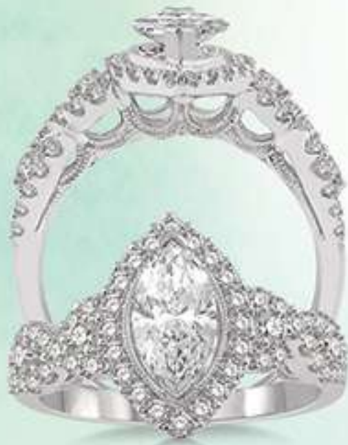
18A 250F2SM 70 DM 14K Center stone size - 1/2 to 3/4 ct. $2,895