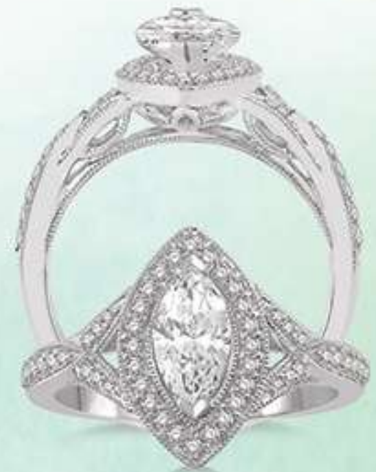
19E 251F3SM .45 DM 14K Center stone size - 3/4 to 1 ct. $2,495

Center stone sold separately Matching band available