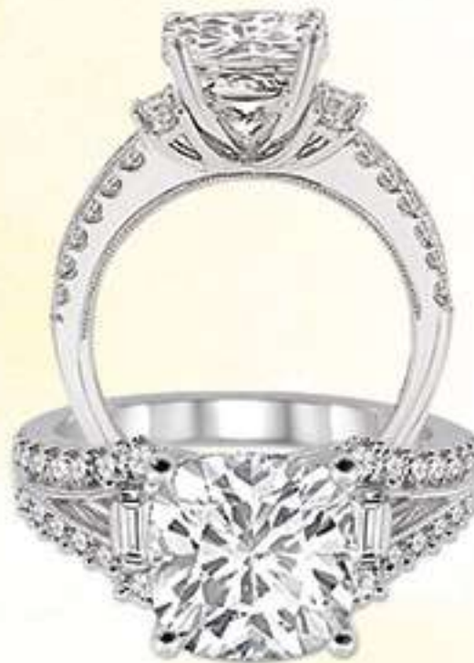
22C 22842SM .75 DM 14K Center stone size - 1 5/8 to 2 1/3 ct. $3,395