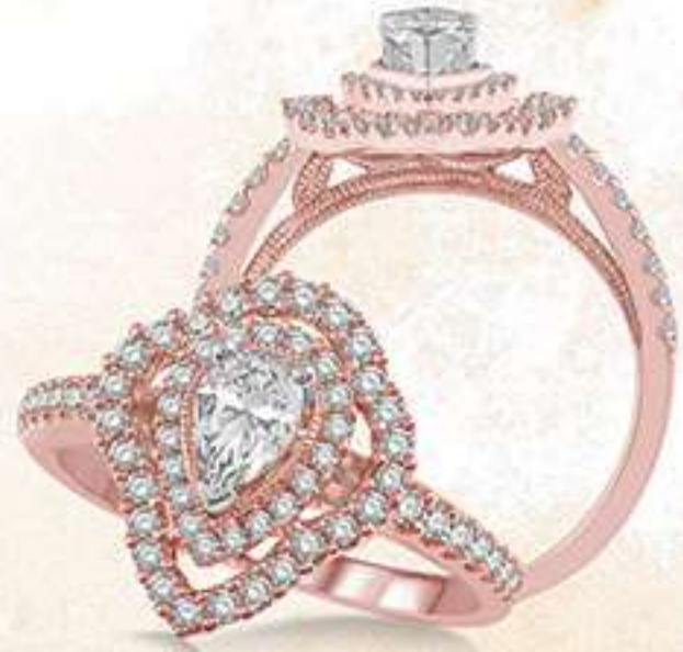
13B 258F2SM .70 DM 14K Center stone size - 7/8 to 1 1/4 ct. $3,050