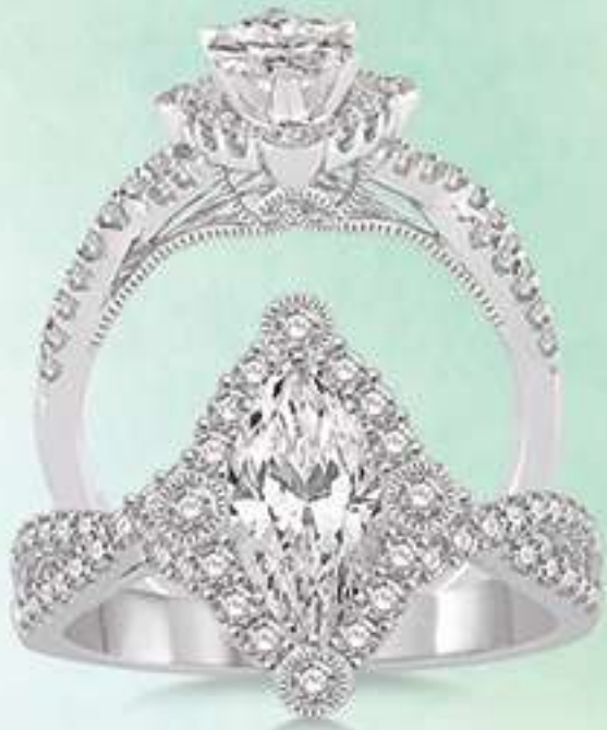
19A 236C3SM .50 DM 14K Center stone size - 5/8 to 7/8 ct. $2,395