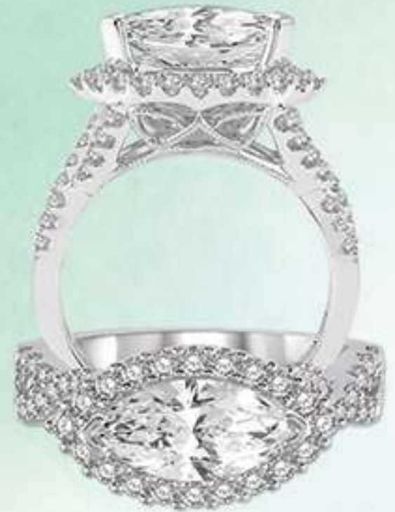
16B 214F3SM .60 DM 14K Center stone size - 3/4 to 1 ct. $2,750