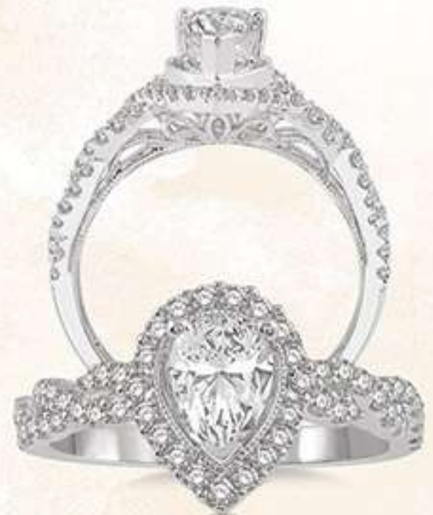
14E 262F2SM .70 DM 14K Center stone size - 7/8 to 1 1/4 ct. $2,995

Center stone sold separately Matching band available