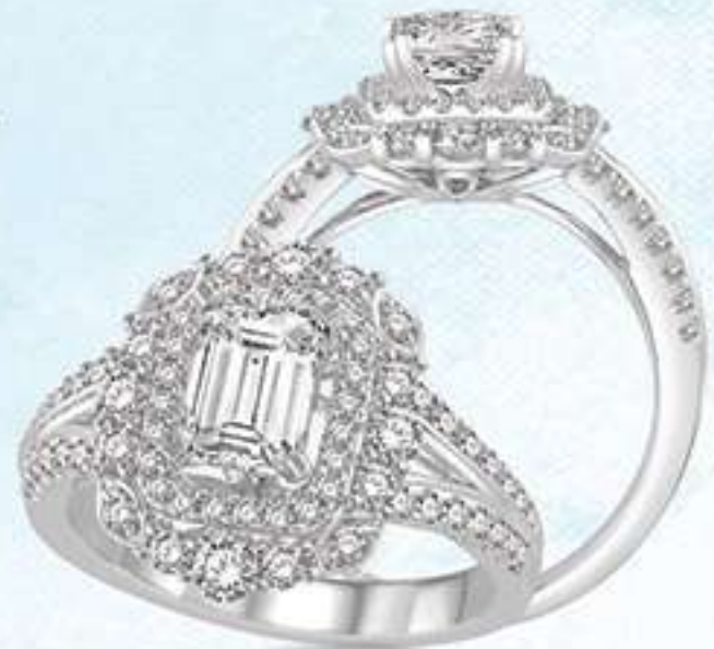
11E 227A2SM .90 DM 14K Center stone size - 7/8 to 1 1/4 ct. $4,095

Center stone sold separately Matching band available