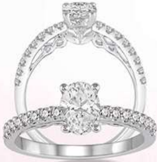
2A 208D6SM .25 DM 14K Center stone size - 3/4 to 1 ct. $1,350