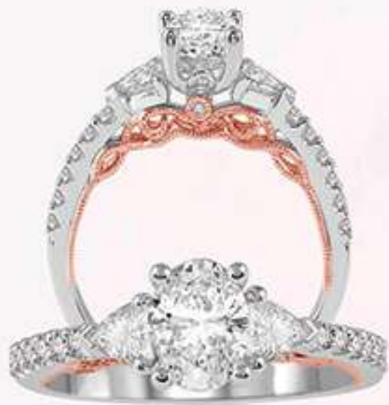
4A 211F3SM .50 DM 14K Center stone size - 5/8 to 7/8 ct. $3,295