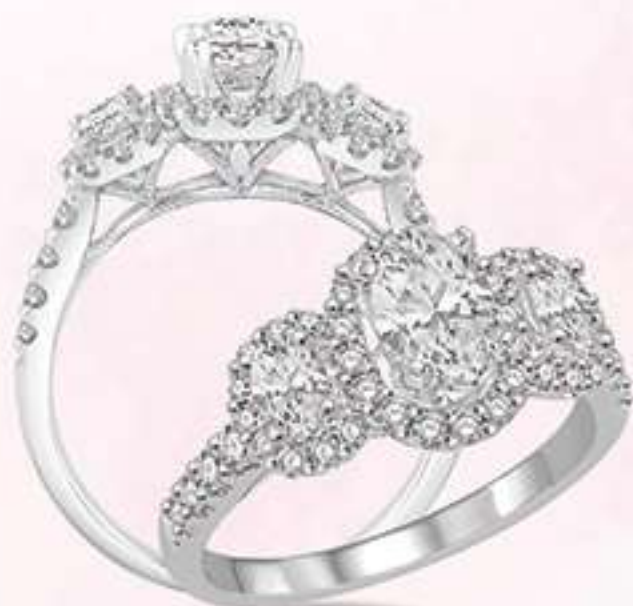
4D 231D2SM .90 DM 14K Center stone size - 5/8 to 7/8 ct. $3,995