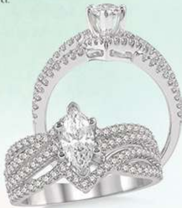
17C 248F2SM .70 DM 14K Center stone size - 5/8 to 7/8 ct. $3,495