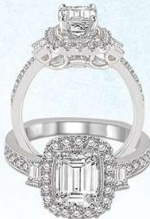
10B 233D3SM .55 DM 14K Center stone size - 7/8 to 1 1/4 ct. $2,695