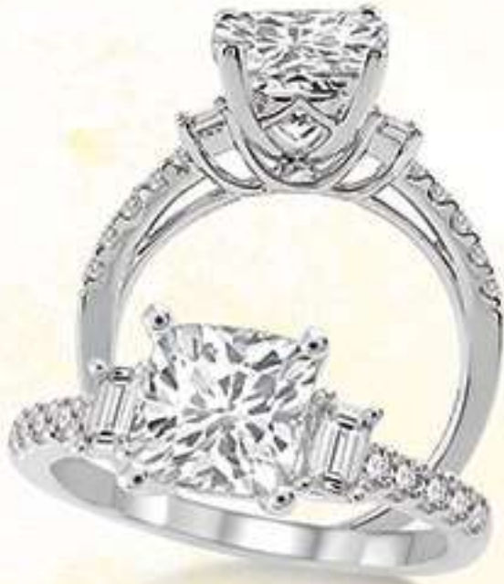
22A 23724SM .40 DM 14K Center stone size - 1 1/4 to 1 3/4 ct. $2,350