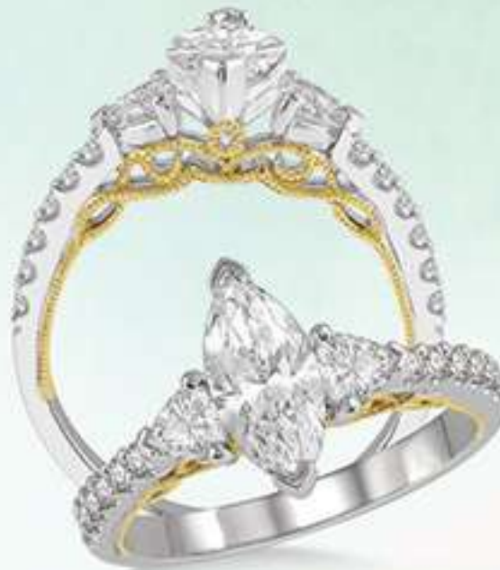
18C 212G3SM 55 DM 14K Center stone size - 3/4 to 1 ct. $3,250