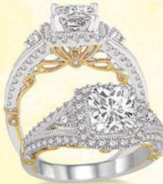
20C 243B3SM .65 DM 14K Center stone size - 7/8 to 1 1/4 ct. $3,150