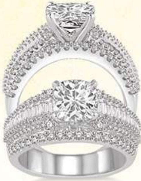
21A 200D0SM 1.40 DM 14K Center stone size - 1 1/4 to 1 3/4 ct. $7,150