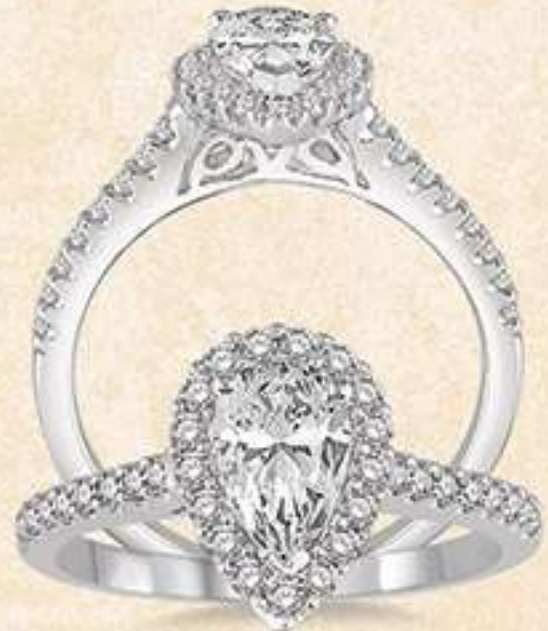
12B 214D4SM .40 DM 14K Center stone size - 5/8 to 7/8 ct. $1,595