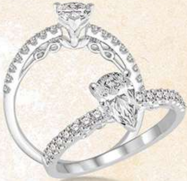
12A 209D6SM .25 DM 14K Center stone size - 5/8 to 7/8 ct. $1,350