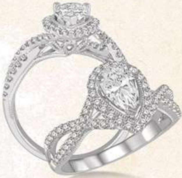
14A 224G3SM .45 DM 14K Center stone size - 5/8 to 7/8 ct. $2,595