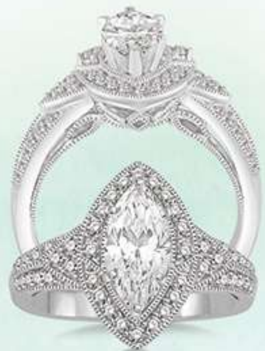
18E 216A3SM 45 DM 14K Center stone size - 7/8 to 1 1/4 ct. $2,995

Center stone sold separately Matching band available