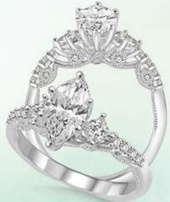
18B 238C3SM 50 DM 14K Center stone size - 5/8 to 7/8 ct. $2,395