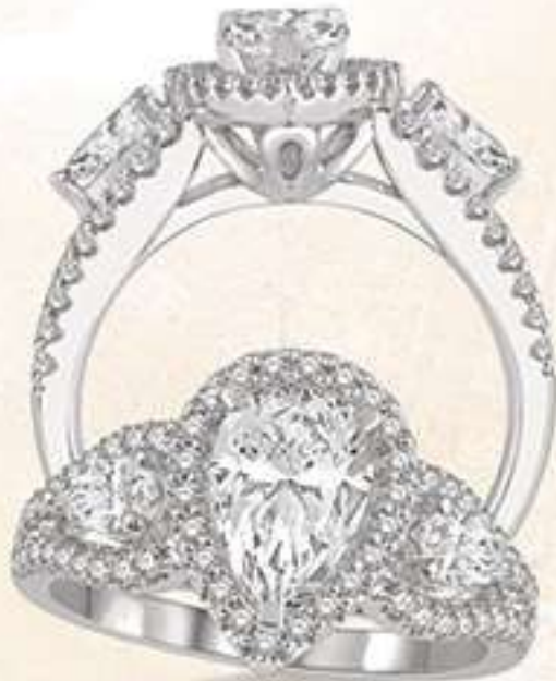
15D 265K2SM .85 DM 14K Center stone size - 5/8 to 7/8 ct. $3,995