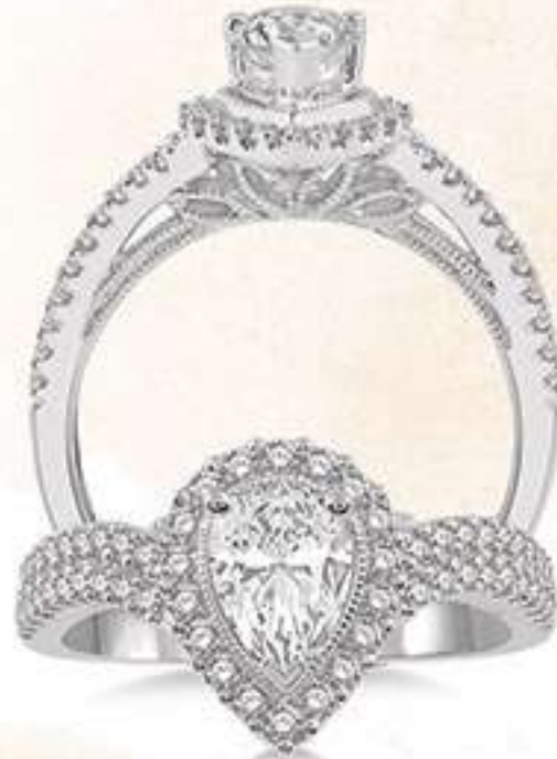
15C 263F3SM .45 DM 14K Center stone size - 5/8 to 7/8 ct. $2,595