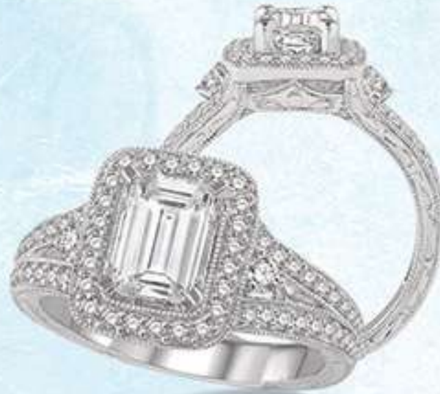
8C 228F3SM .50 DM 14K Center stone size - 7/8 to 1 1/4 ct. $2,950