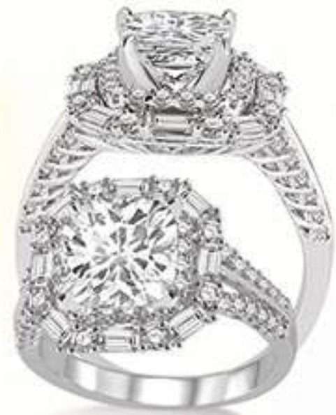
21E 15420SM 1.15 DM 14K Center stone size - 7/8 to 1 1/4 ct. $4,695

Center stone sold separately Matching band available