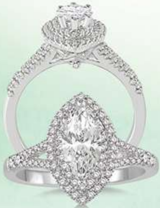
16A 233C3SM .50 DM 14K Center stone size - 5/8 to 7/8 ct. $2,695