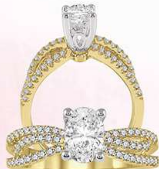
5E 246F4SM .40 DM 14K Center stone size - 5/8 to 7/8 ct. $2,150

Center stone sold separately Matching band available