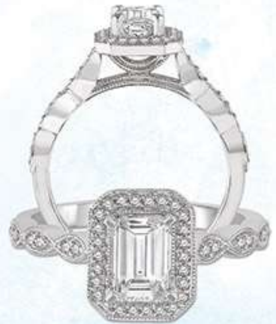
9B 225F7SM .20 DM 14K Center stone size - 5/8 to 7/8 ct. $1,595