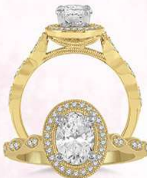
7C 249G8SM .15 DM 14K Center stone size - 5/8 to 7/8 ct. $1,595