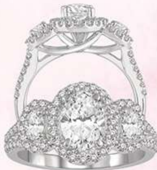
4C 267K2SM .85 DM 14K Center stone size - 5/8 to 7/8 ct. $3,795