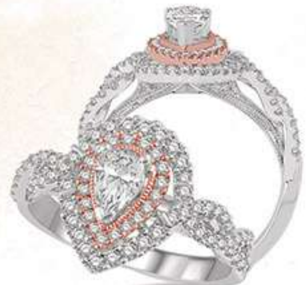
15E 259F2SM .70 DM 14K Center stone size - 7/8 to 1 1/4 ct. $3,295

Center stone sold separately Matching band available