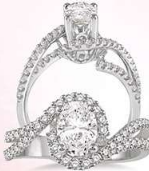
5C 207F3SM .55 DM 14K Center stone size - 5/8 to 7/8 ct. $2,350