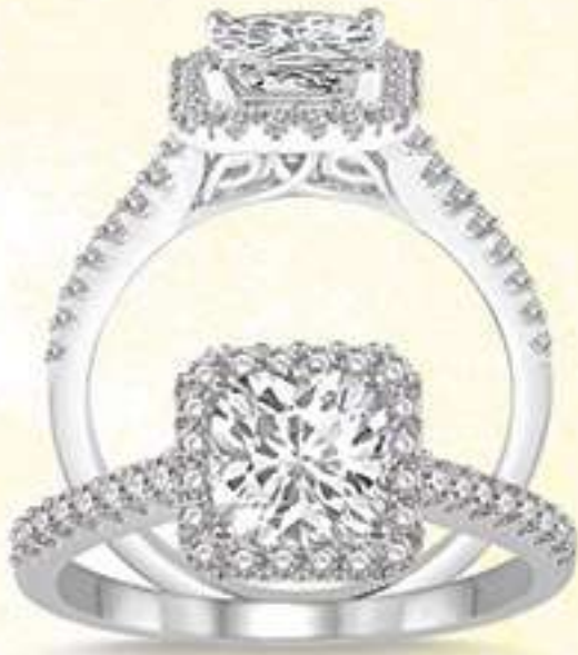
20A 219D4SM .40 DM 14K Center stone size - 7/8 to 1 1/4 ct. $1,695