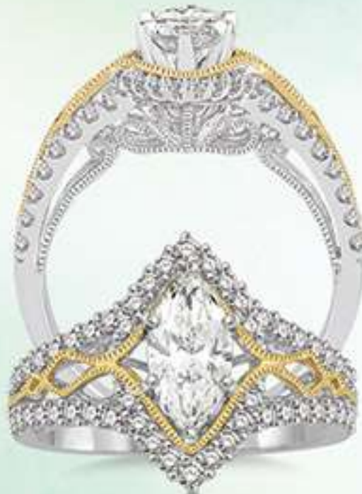
19C 224A3SM .65 DM 14K Center stone size - 3/4 to 1 ct. $3,395