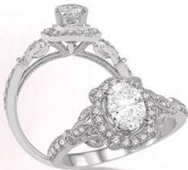
7A 253F5SM .30 DM 14K Center stone size - 5/8 to 7/8 ct. $2,050