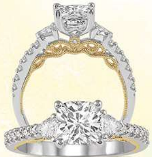
22E 213G3SM .45 DM 14K Center stone size - 7/8 to 1 1/4 ct. $2,750

Center stone sold separately Matching band available