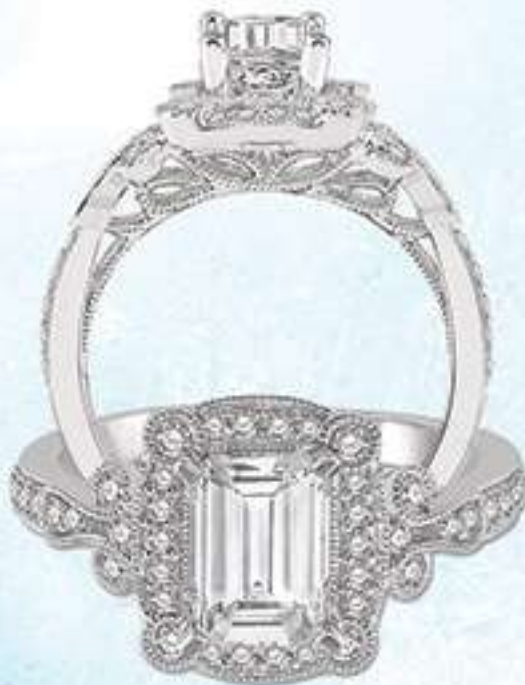
9D 229F3SM .45 DM 14K Center stone size - 7/8 to 1 1/4 ct. $2,350