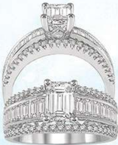
11D 218E1SM 1.00 DM 14K Center stone size - 7/8 to 1 1/4 ct. $5,095