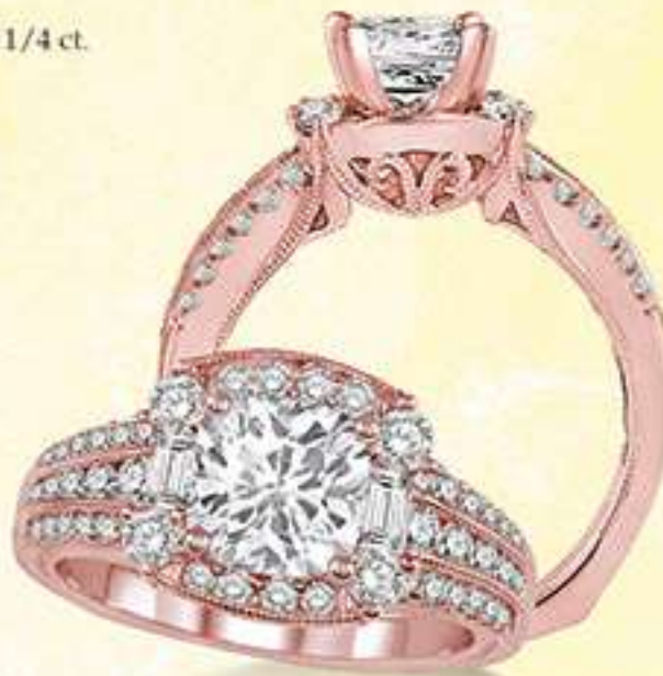
23C 22872SM .85 DM 14K Center stone size - 1 1/4 to 1 3/4 ct. $4,295