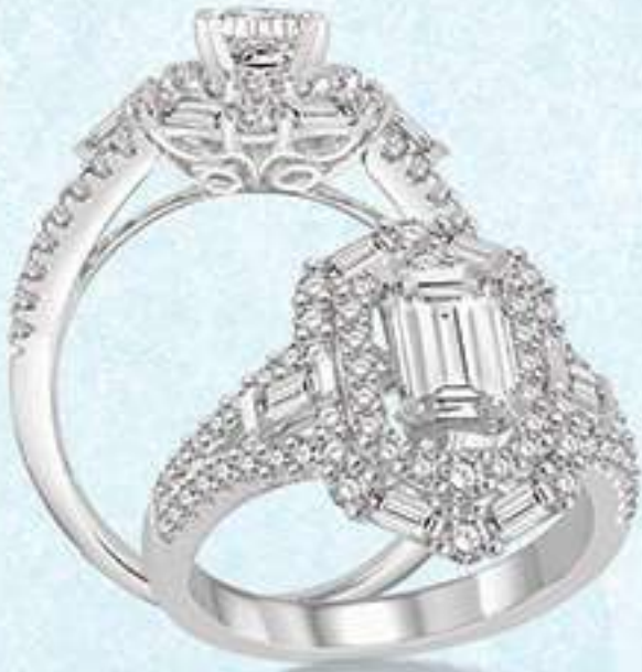
11A 228A1SM 1.05 DM 14K Center stone size - 7/8 to 1 1/4 ct. $4,850