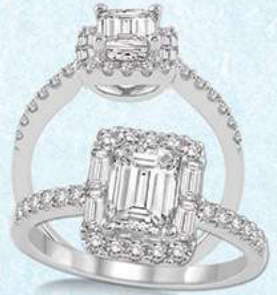
8B 226A3SM .50 DM 14K Center stone size - 7/8 to 1 1/4 ct. $2,395