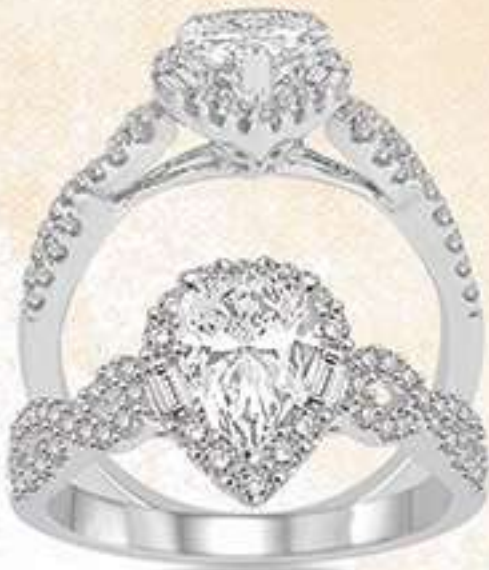
12D 203H3SM .45 DM 14K Center stone size - 1/2 to 3/4 ct. $2,195