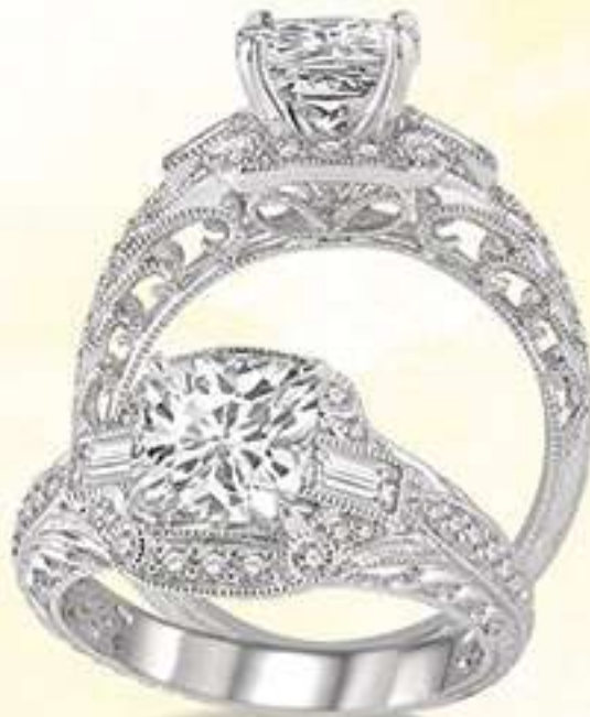
23D 205H3SM .60 DM 14K Center stone size - 7/8 to 1 1/4 ct. $3,350