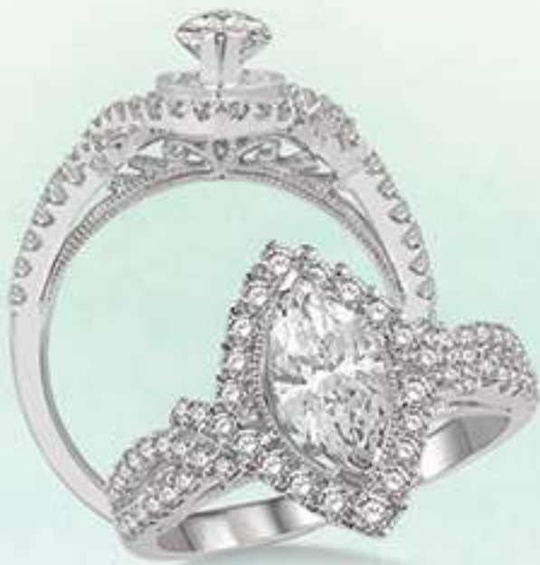
17D 249F3SM .55 DM 14K Center stone size - 5/8 to 7/8 ct. $2,795