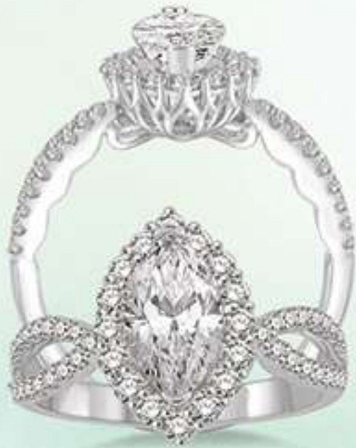
17A 221A3SM .65 DM 14K Center stone size - 5/8 to 7/8 ct. $3,095