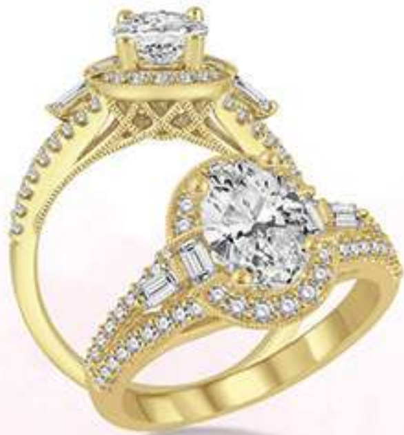
6A 250C3SM .60 DM 14K Center stone size - 1/2 to 3/4 ct. $2,995