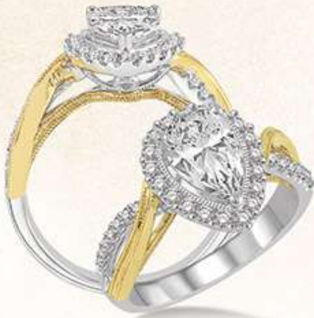
15A 231E4SM .40 DM 14K Center stone size - 1 to 1 1/4 ct. $2,195