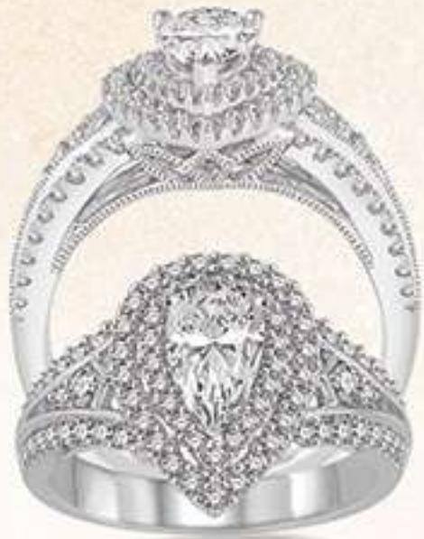
13A 218A2SM .75 DM 14K Center stone size - 5/8 to 7/8 ct. $3,895