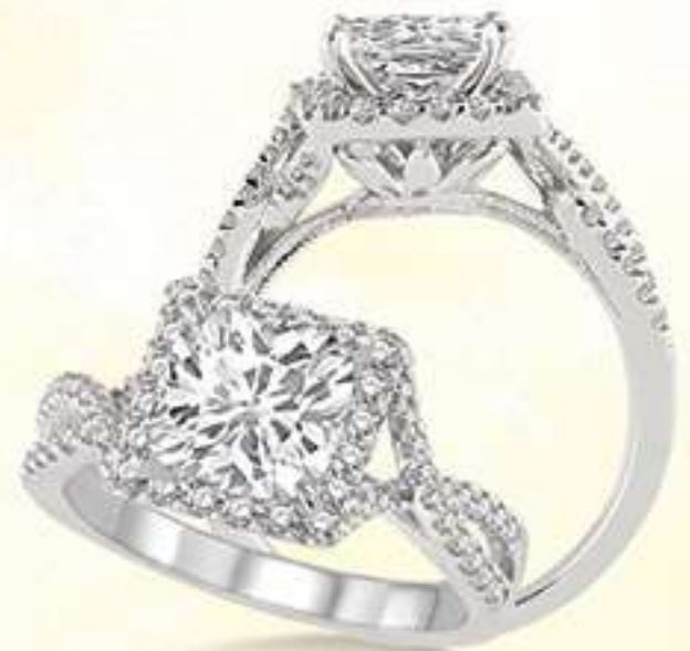
20E 24843SM .50 DM 14K Center stone size - 7/8 to 1 1/4 ct. $2,895

Center stone sold separately Matching band available