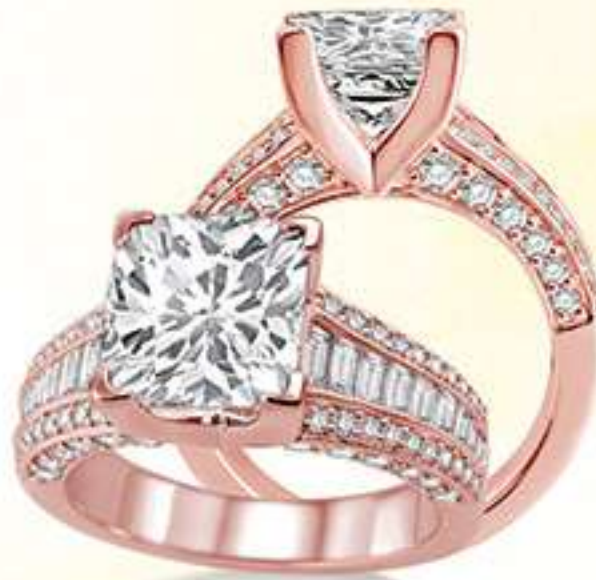
21C 22820SM 1.30 DM 14K Center stone size - 1 5/8 to 2 1/3 ct. $7,095