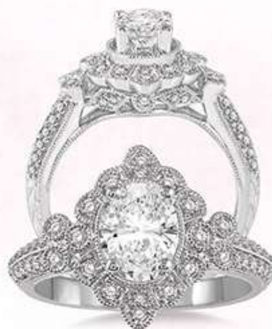
7E 222F3SM .45 DM 14K Center stone size - 5/8 to 7/8 ct. $2,895

Center stone sold separately Matching band available