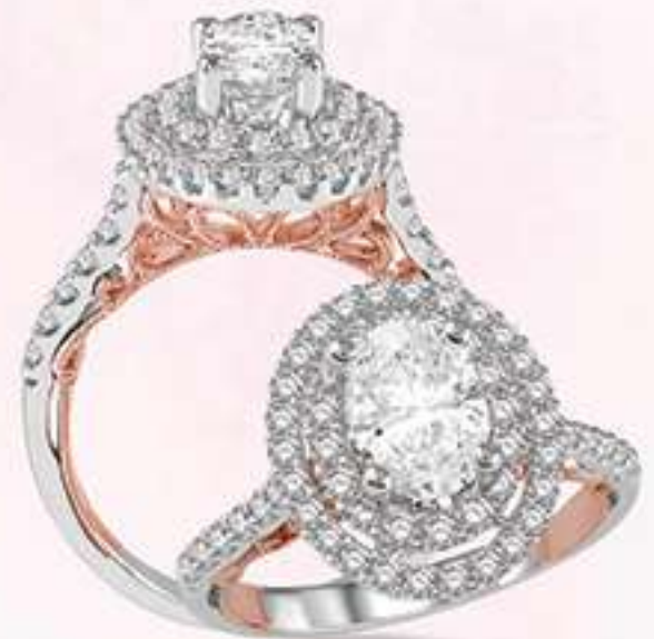
3E 202F3SM .65 DM 14K Center stone size - 5/8 to 7/8 ct. $2,995

Center stone sold separately Matching band available