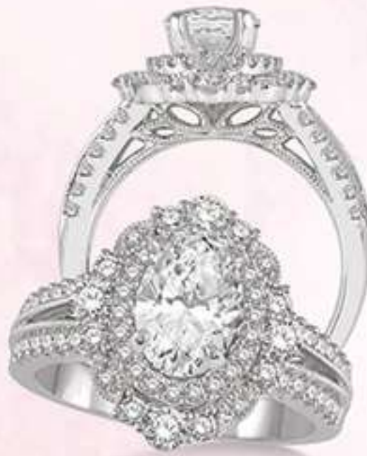
3C 208H2SM .85 DM 14K Center stone size - 7/8 to 1 1/4 ct. $3,895