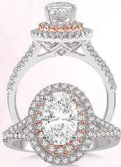
3A 247C2SM .65 DM 14K Center stone size - 7/8 to 1 1/4 ct. $3,150