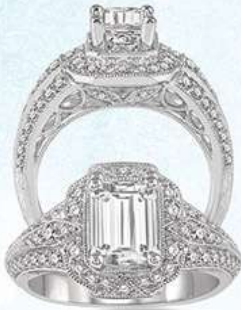
9A 217F3SM .60 DM 14K Center stone size - 7/8 to 1 1/4 ct. $3,250