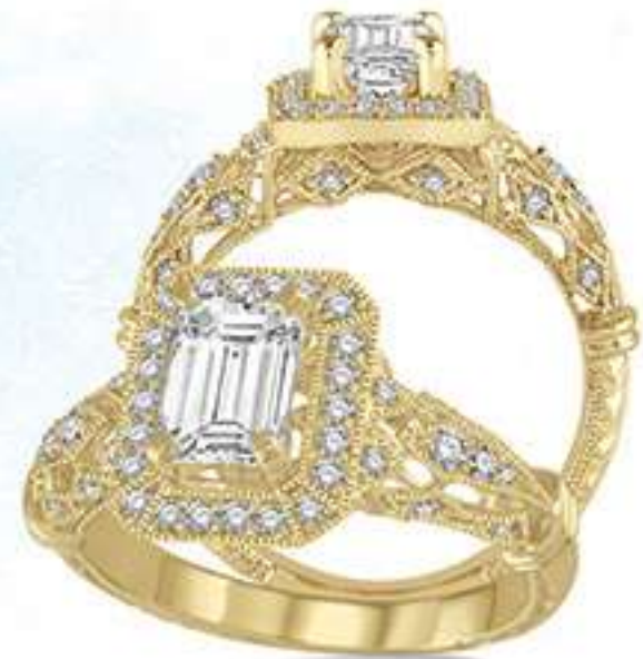
9E 235D5SM .35 DM 14K Center stone size - 7/8 to 1 1/4 ct. $2,195

Center stone sold separately Matching band available