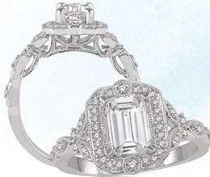
9C 227F6SM .25 DM 14K Center stone size - 7/8 to 1 1/4 ct. $1,895