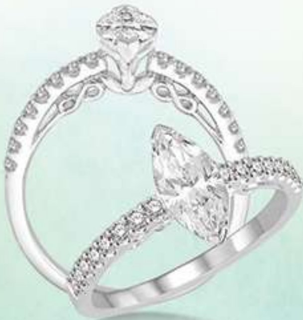
16D 213D5SM .30 DM 14K Center stone size - 7/8 to 1 1/4 ct. $1,450