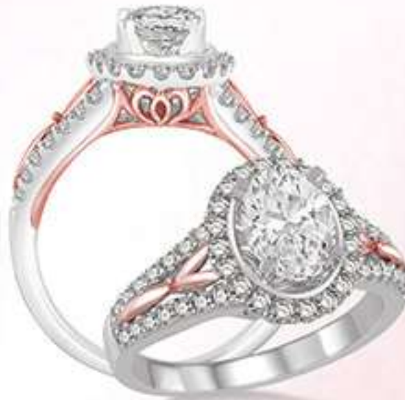
6C 242A3SM .55 DM 14K Center stone size - 1 to 1 1/4 ct. $3,050