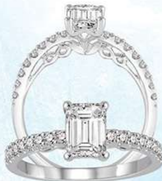
10E 212D6SM .25 DM 14K Center stone size - 7/8 to 1 1/4 ct. $1,395

Center stone sold separately Matching band available