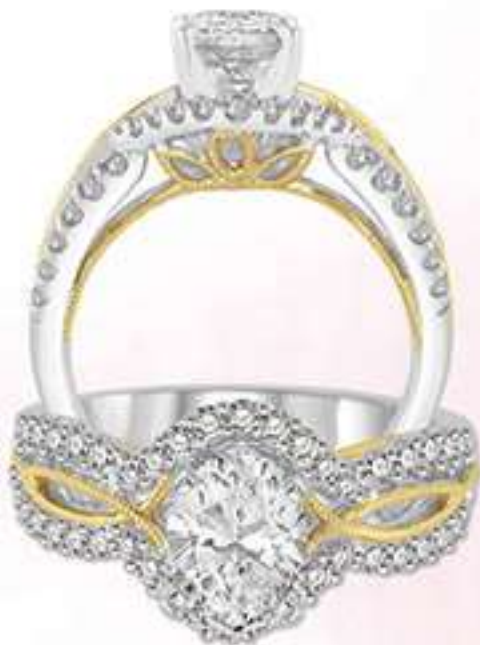
6D 241A3SM .50 DM 14K Center stone size - 1 to 1 1/4 ct. $2,895