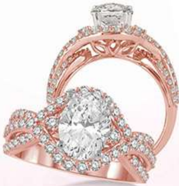
5A 209H2SM .75 DM 14K Center stone size - 7/8 to 1 1/4 ct. $3,350