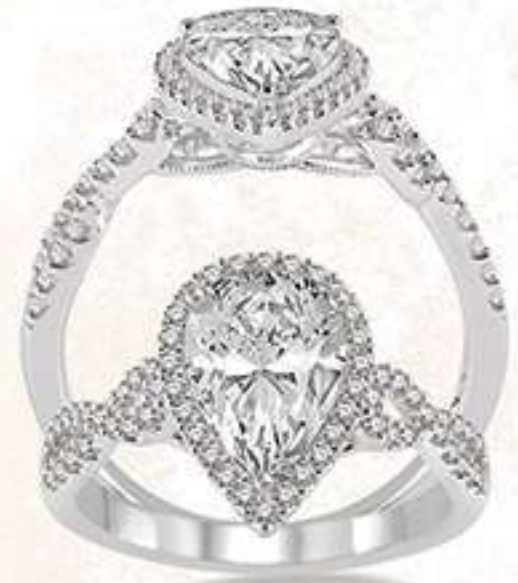
15B 253C3SM .45 DM 14K Center stone size - 5/8 to 7/8 ct. $1,995