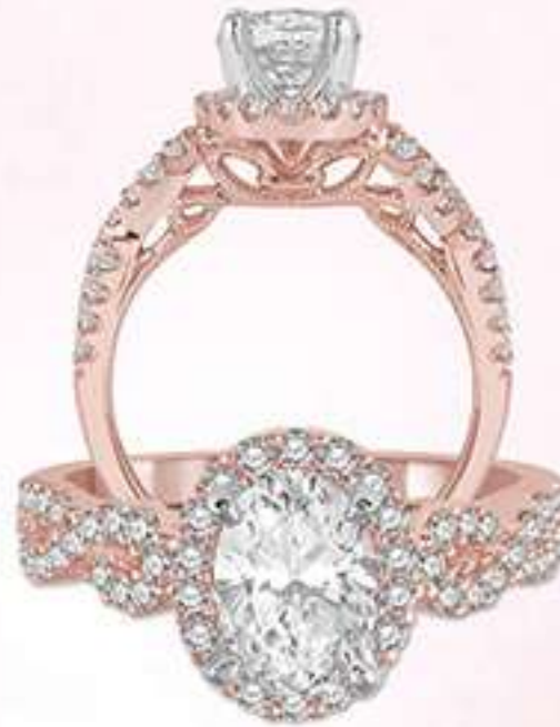
2C 245C3SM .50 DM 14K Center stone size - 7/8 to 1 1/4 ct. $2,595