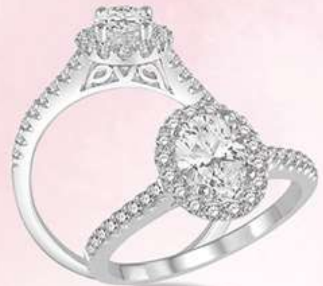
2E 216D5SM .35 DM 14K Center stone size - 3/4 to 1 ct. $1,595

Center stone sold separately Matching band available