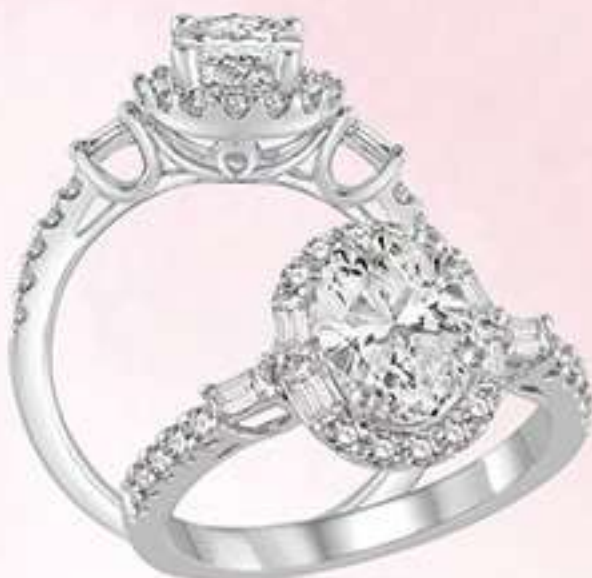
5D 240A3SM .50 DM 14K Center stone size - 1 to 1 1/4 ct. $2,495