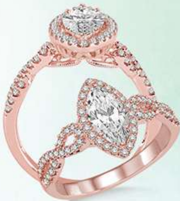
19D 232C4SM .40 DM 14K Center stone size - 1/2 to 3/4 ct. $2,095