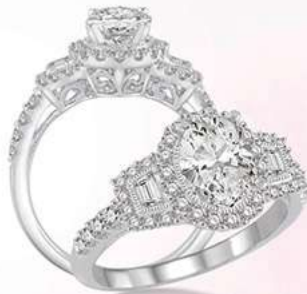
4B 244A1SM 1.00 DM 14K Center stone size - 1 to 1 1/4 ct. $6,795