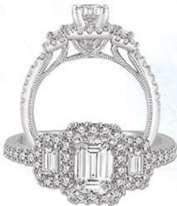
10D 243C3SM .60 DM 14K Center stone size - 5/8 to 7/8 ct. $2,850