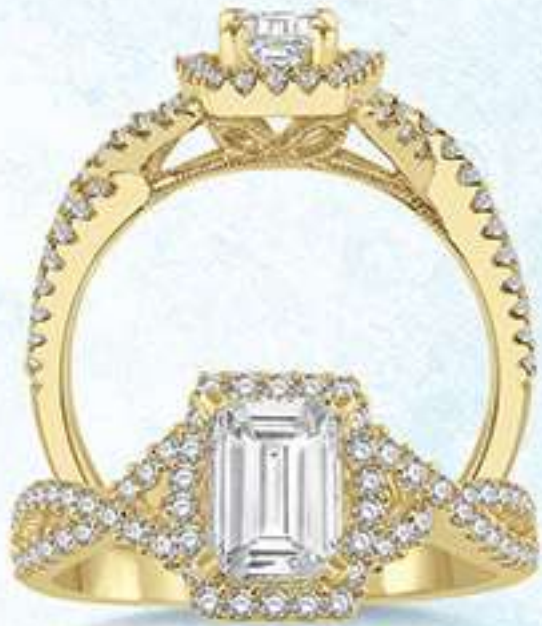
8A 204G3SM .45 DM 14K Center stone size - 5/8 to 7/8 ct. $2,395