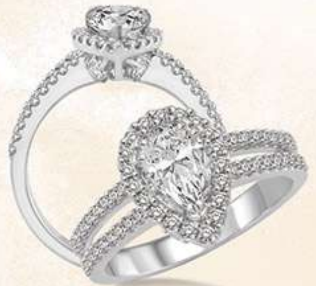
12E 22163SM .60 DM 14K Center stone size - 7/8 to 1 1/4 ct. $2,995

Center stone sold separately Matching band available