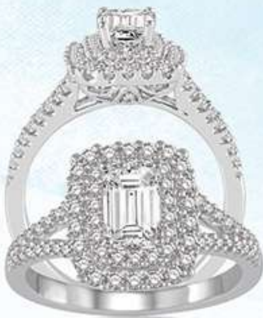
8D 239C2SM .75 DM 14K Center stone size - 3/4 to 1 ct. $3,150