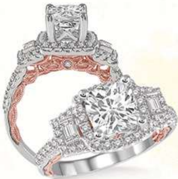
22D 214G3SM .60 DM 14K Center stone size - 7/8 to 1 1/4 ct. $3,195