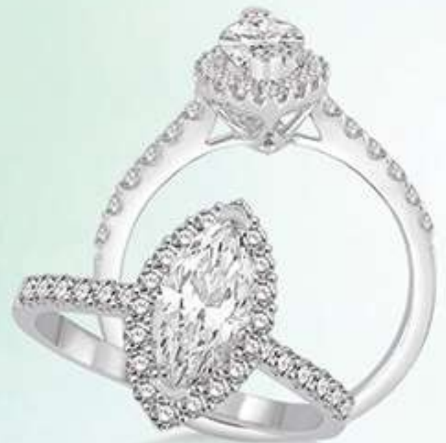
16E 225A3SM .50 DM 14K Center stone size - 1 1/4 to 1 3/4 ct. $2,395

Center stone sold separately Matching band available