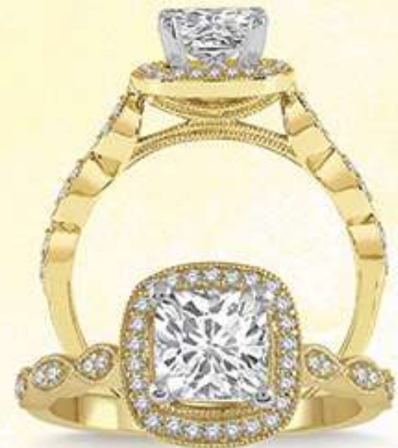
23E 248G7SM .20 DM 14K Center stone size - 5/8 to 7/8 ct. $1,595

Center stone sold separately Matching band available