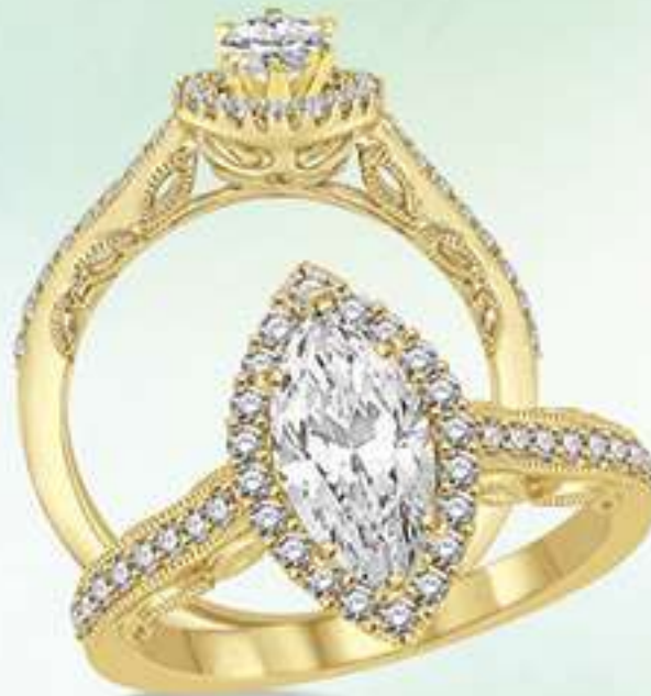
16C 235C4SM .40 DM 14K Center stone size - 1/2 to 3/4 ct. $2,050