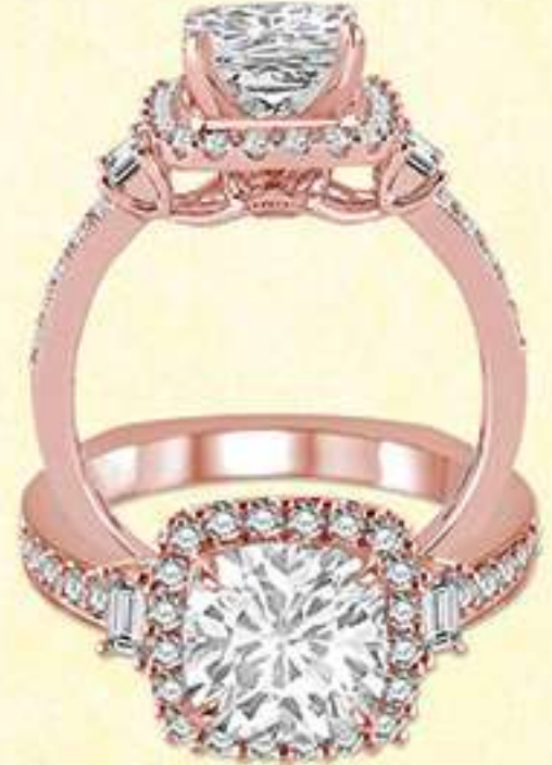
20B 15463SM .60 DM 14K Center stone size - 7/8 to 1 1/4 ct. $3,095