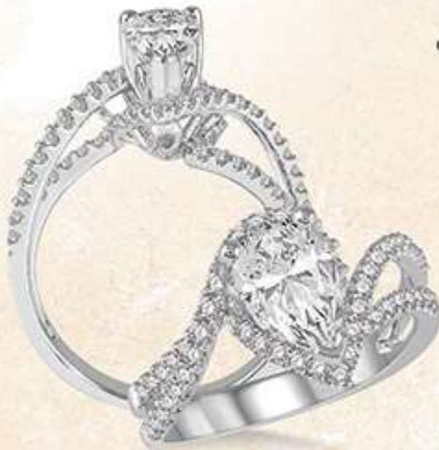
13D 206F3SM .55 DM 14K Center stone size - 5/8 to 7/8 ct. $2,450