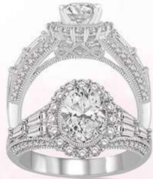
5B 217A2SM .85 DM 14K Center stone size - 1 to 1 1/4 ct. $4,595