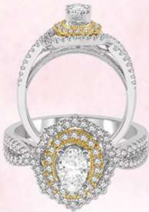
3D 252F3SM .50 DM 14K Center stone size - 1/2 to 3/4 ct. $2,795