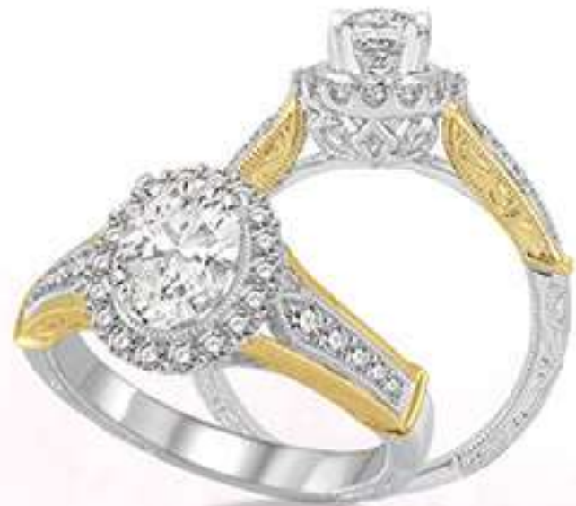
6B 251C4SM .40 DM 14K Center stone size - 5/8 to 7/8 ct. $2,395