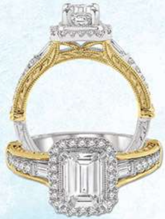
11B 203G3SM .45 DM 14K Center stone size - 7/8 to 1 1/4 ct. $2,750