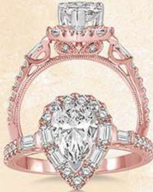
12C 257C2SM .60 DM 14K Center stone size - 7/8 to 1 1/4 ct. $2,895