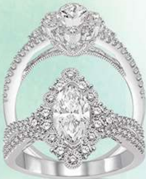
18D 219A3SM 55 DM 14K Center stone size - 1/2 to 3/4 ct. $2,950