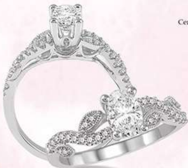
7D 208F6SM .25 DM 14K Center stone size - 5/8 to 7/8 ct. $1,550