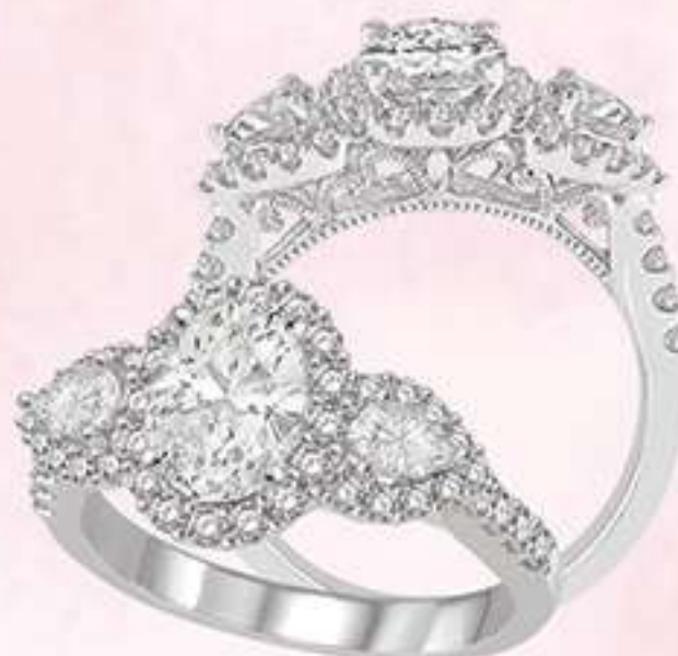
4E 243A1SM .95 DM 14K Center stone size - 1 to 1 1/4 ct. $4,795

Center stone sold separately Matching band available