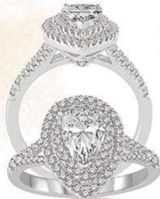
13E 254C2SM .70 DM 14K Center stone size - 7/8 to 1 1/4 ct. $3,295

Center stone sold separately Matching band available