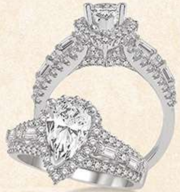
14B 226E2SM .85 DM 14K Center stone size - 5/8 to 7/8 ct. $4,195