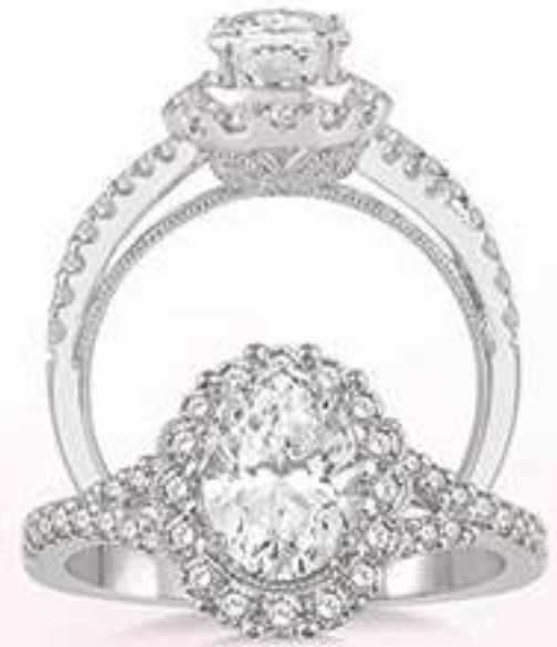
2B 219G3SM .60 DM 14K Center stone size - 5/8 to 7/8 ct. $2,695