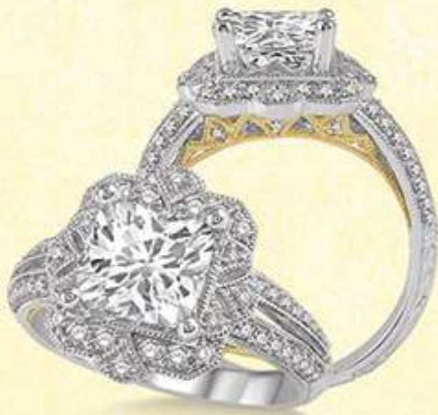
23A 220F4SM .40 DM 14K Center stone size - 7/8 to 1 1/4 ct. $2,950