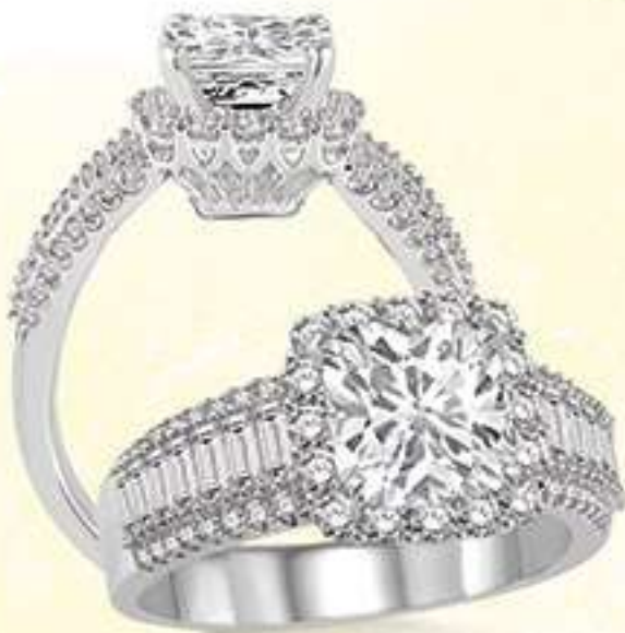
21D 18370SM 1.20 DM 14K Center stone size - 1 to 1 1/2 ct. $6,095