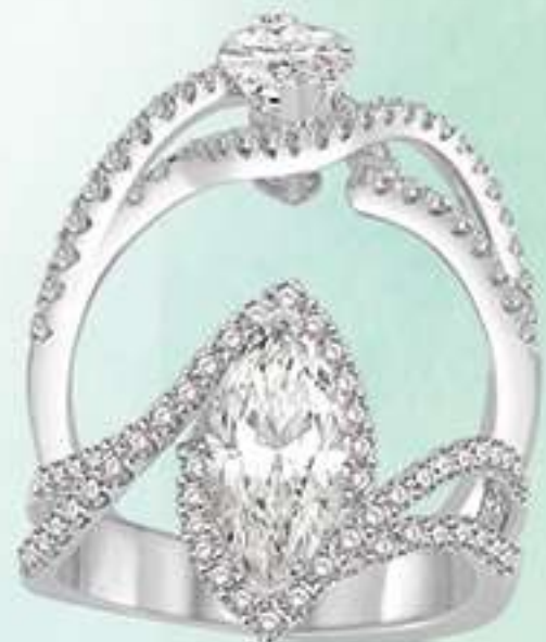
17E 220A3SM .65 DM 14K Center stone size - 7/8 to 1 1/4 ct. $2,695

Center stone sold separately Matching band available