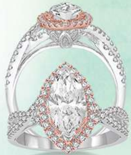
17B 222A3SM .50 DM 14K Center stone size - 3/4 to 1 ct. $2,895