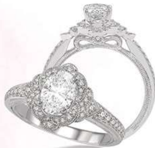
7B 255F6SM .25 DM 14K Center stone size - 3/4 to 1 ct. $1,950