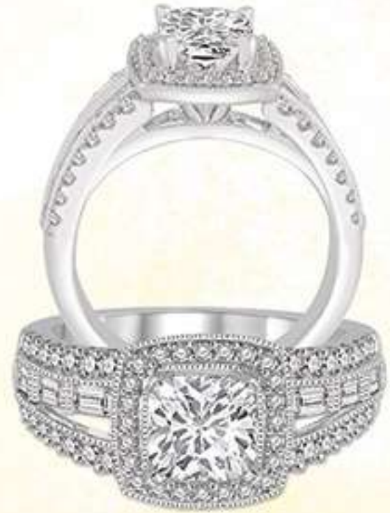
21B 264A2SM .80 DM 14K Center stone size - 7/8 to 1 1/4 ct. $4,050