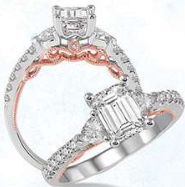
10A 209F3SM .50 DM 14K Center stone size - 7/8 to 1 1/4 ct. $3,295