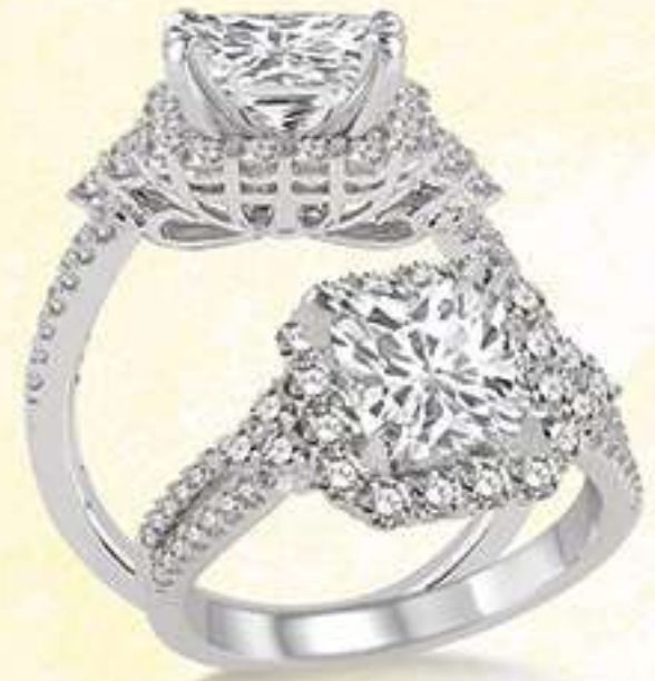
23B 14132SM .85 DM 14K Center stone size - 7/8 to 1 1/4 ct. $3,695