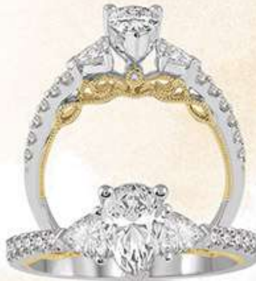
13C 210F3SM .50 DM 14K Center stone size - 5/8 to 7/8 ct. $3,350