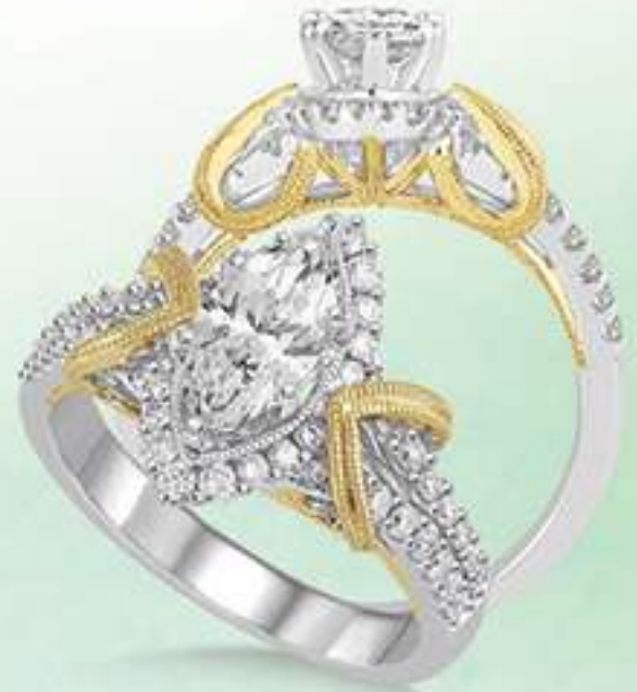
19B 223A3SM .50 DM 14K Center stone size - 3/4 to 1 ct. $3,095