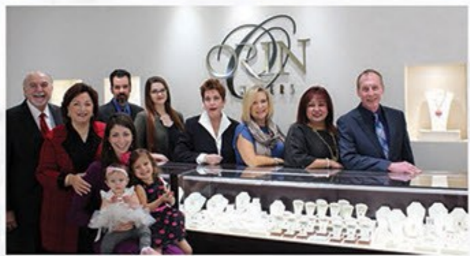
NORTHVILLE 101 Main Street at Center | 248.349.6940