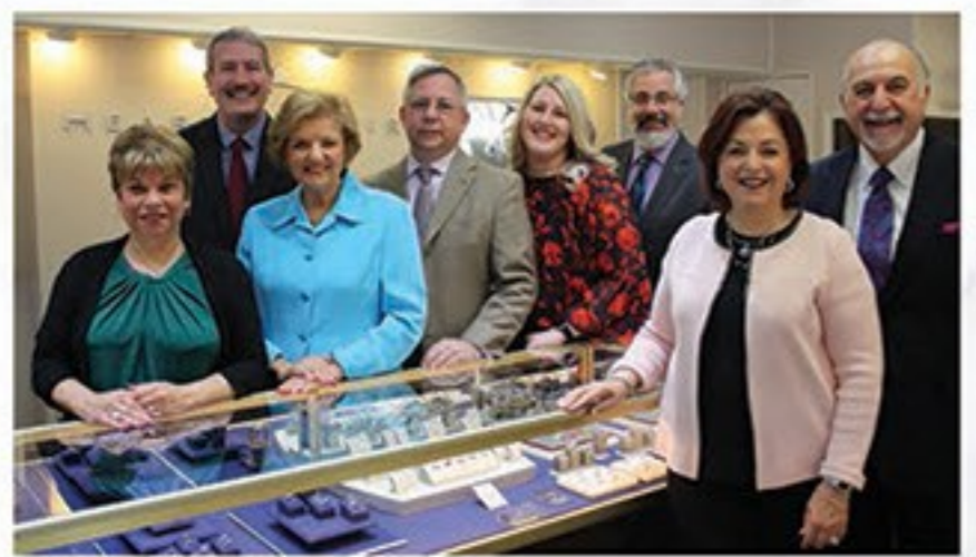
GARDEN CITY 29317 Ford Road at Middlebelt | 734.422.7030